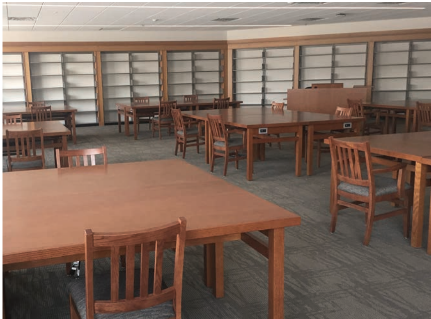
The new reading room opened March 19.

All of these materials and more are open and available to the public. For more information on the collection, visit z.umn.edu/abelson .